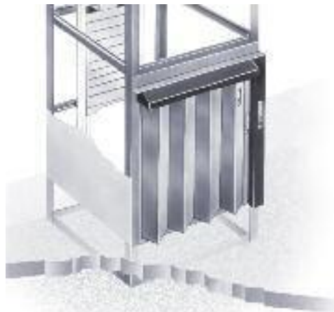
Space-saving concertina shutter leaf gate – can be installed as an optional extra.